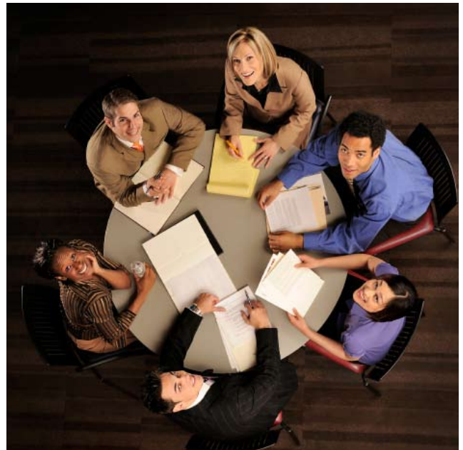
In case you didn't know, the Newhouse Strategic Marketing, Inc. logo design is based upon this type of teamwork image