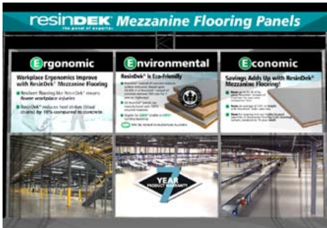
Cornerstone Specialty Wood Products, Inc. ProMat® 2011 Booth.