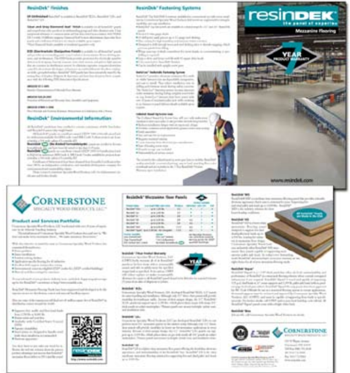
Cornerstone Specialty Wood Products, LLC New Product Brochure (Top) and Trade Show Post Card (Bottom)